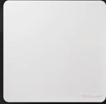
MQ5101J (1W) 1 Gang 1 Way Switch 10AX 250V~