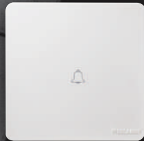
MQ5101J - BELL 1 Gang Bell Switch 10A 250V~