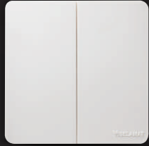
MQ5102J (1W) 2 Gang 1 Way Switch 10AX 250V~