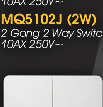
MQ5102J (2W) 2 Gang 2 Way Switch 10AX 250V~