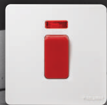
MQ5545 1 Gang 45A Double Pole Switch with Neon & Earth 45A 250V~