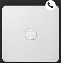
MQ5101 - TEL 1 Gang RJ11 Cat 3 Telephone Outlet