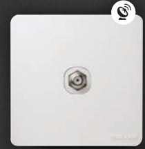
MQ5101 - SAT 1 Gang Satellite TV Outlet (Astro)