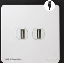
MQ5201 - USB 2 Gang USB Power Charging Outlet Single USB Output : 5Vdc (2.4A + 2.4A)