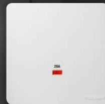
MQ5101 - 20A 1 Gang 20A Double Pole Switch with Light Indicator 20A 250V~