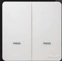
MQ5102J - BELL 2 Gang Bell Switch (Auto Gate Control) 10A 250V~