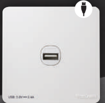
MQ5101 - USB 1 Gang USB Power Charging Outlet Single USB Output : 5Vdc (2.4A)