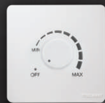
MQ5630D 630W Dimmer Switch 630W 250V~