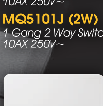
MQ5101J (2W) 1 Gang 2 Way Switch 10AX 250V~