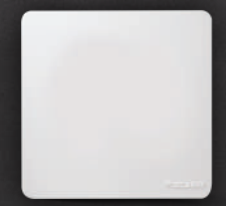
MQ5100 1 Gang Blank Plate