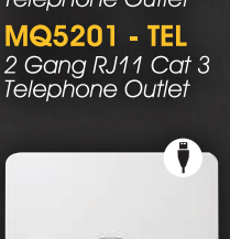
MQ5201 - TEL 2 Gang RJ11 Cat 3 Telephone Outlet