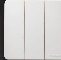
MQ5103J (1W) 3 Gang 1 Way Switch 10AX 250V~