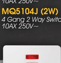
MQ5104J (2W) 4 Gang 2 Way Switch 10AX 250V~