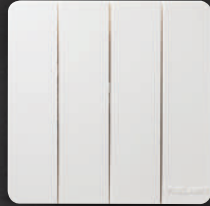
MQ5104J (1W) 4 Gang 1 Way Switch 10AX 250V~