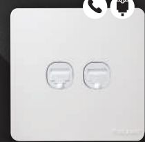
MQ5201 - TEL / COM 2 Gang RJ11 Telephone Outlet & RJ45 Cat.5e Data Outlet