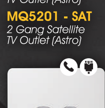
MQ5201 - SAT 2 Gang Satellite TV Outlet (Astro)