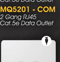
MQ5201 - COM 2 Gang RJ45 Cat.5e Data Outlet