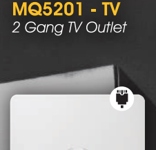
MQ5201 - TV 2 Gang TV Outlet