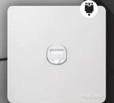
MQ5101 - CAT 6 1 Gang Category 6 Data Outlet