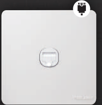
MQ5101 - COM 1 Gang RJ45 Cat.5e Data Outlet