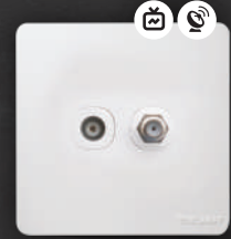
MQ5201 - TV / SAT 2 Gang TV + Satellite Outlet (Astro)