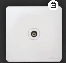
MQ5101 - TV 1 Gang TV Outlet